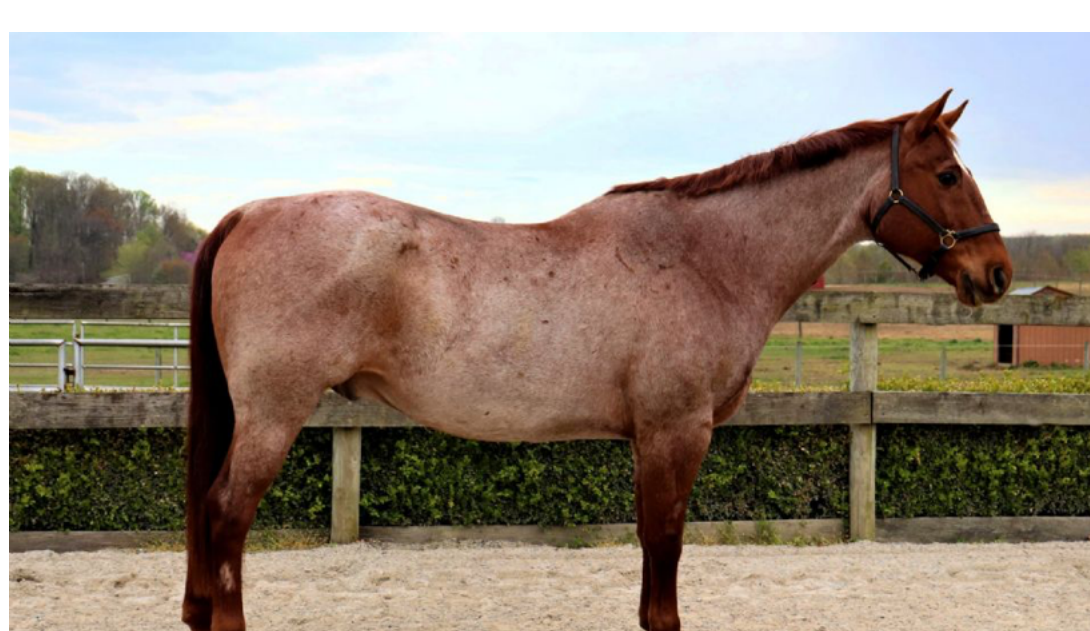
22-year-old Quarter Horse gelding, 15.2hh

Murphy cannot wait to find a family of his own. This handsome red roan gelding would make an excellent companion for any herd. His quiet demeanor makes him a great fit for older horses needing a calming friend or for younger horses needing a stable leader. While Murphy may be retired from a riding career, he has so much to offer. He tries hard to please and has participated in light groundwork and liberty work. Murphy can be managed on field board but is also very quiet in a stall. This easy-going guy is available for adoption through DEFHR's Guardian Program.